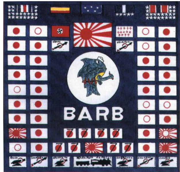
Final World War II Battle Flag of USS Barb (SS-220)

Footnote: Eugene Bennett Fluckey retired from the Navy as a Rear Admiral, and wears in addition to his Medal of Honor, FOUR Navy Crosses...a record of awards unmatched by any living American. In 1992 his own history of the U.S.S. Barb was published in the award winning book, THUNDER BELOW. Over the past several years proceeds from the sale of this exciting book have been used by Admiral Fluckey to provide free reunions for the men who served him aboard the Barb, and their wives.