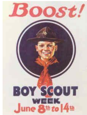
1918 Boy Scout Week Poster

In 1938, in recognition of his service to Boy Scouts, Norman Rockwell was awarded the Silver Buffalo. This award is the highest acknowledgment the Boy Scouts of America gives for "Distinguished Service to Boyhood."