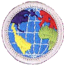
Citizenship in the WORLD

Each boy will be able to chose one badge to complete. The Merit badges will be taught by merit badge counselors and the boys will be given a blue card upon completion. In order to participate in the skating merit badge, please bring roller blades or roller skates. The time of the clinic will last about three hours or until the merit badge is finished. All scouts are encouraged to attend. For more information contact Jeremy Baldwin at 203-8273